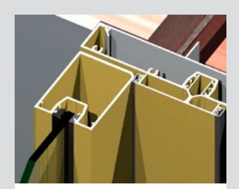
Unique double-sided door stops allow for easy fitting of hinged screen doors.