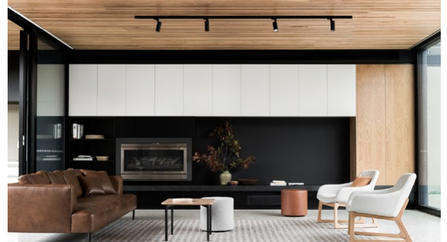
Architect: Figr Builder: Grundella Constructions