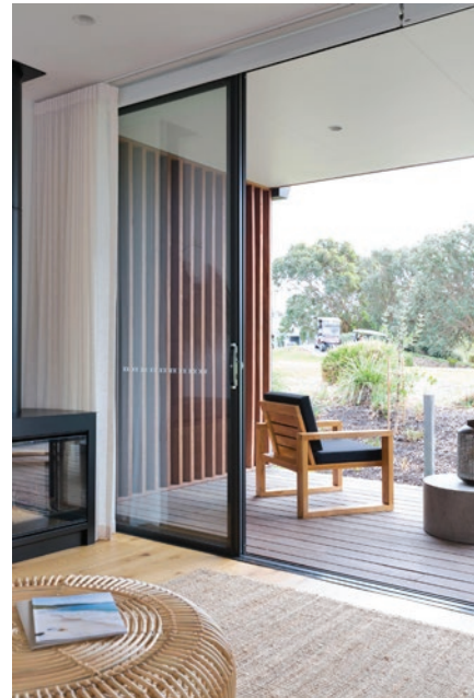
Builder: Evolve Building Group.