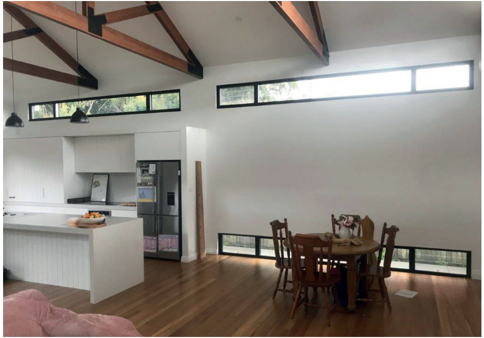
Architect: Stronarch Architects. Builder: Tynan Building.

For more information, visit: awsaustralia.com.au/vantage