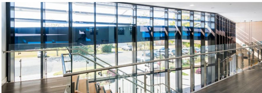
Architect: Jackson Teece Architecture. Builder: Woollam Constructions.