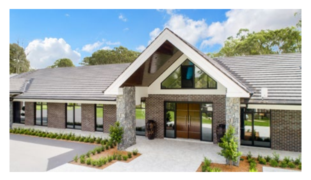
Architect: Fyffe Design Services. Builder: Gremmo Homes.