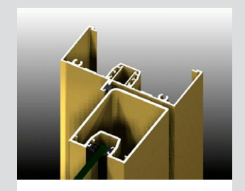
Our 50mm thick doors are about 70% stronger than industry standard 44mm thick panels. This is important if you want to make doors higher than 2100mm.