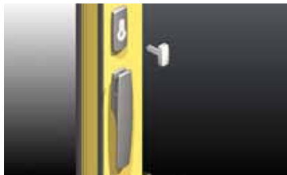
ANDO™ bi-fold activator can also be supplied in a key locking format.