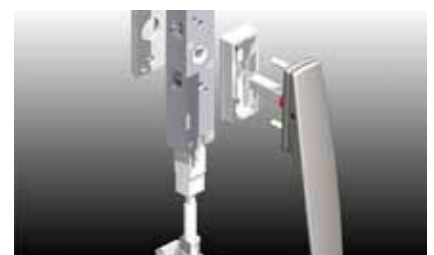
The bi-fold activator motor sits snugly in the frame and is positioned with nylon spacers again to ensure the bolts are in the right location in relation to head and sill.