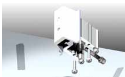
Bi-fold doors are only as good as the door joinery. Our doors are assembled with heavy duty extruded aluminium spigots and backing plates.