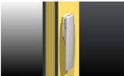
ANDO™ bi-fold activator can be supplied non-key locking. The furniture is available in a range of standard or SPECIAL colours.